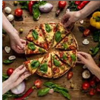
2 Hrs Unlimited Pizza $35 per person