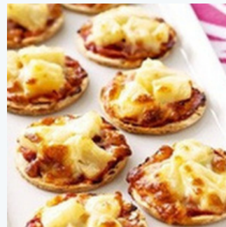
Mini Pizzas 2 pieces per person