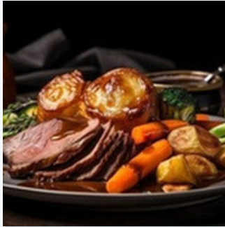
Roast Chicken and Beef $55 per person