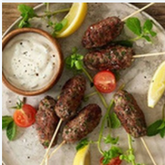
Lamb Kofta 2 per person