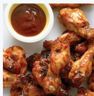
Chicken Drumsticks 2 per person