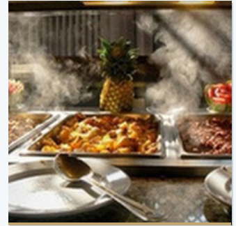
Self Serve Buffet Custom Pricing depending on choice