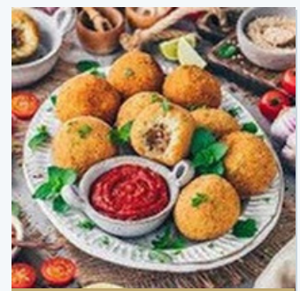
Mozzarella Cheese Balls 2 per person