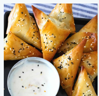
Stuffed Samosas 2 per person