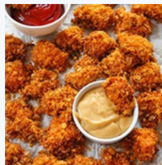
Southern Fried Chicken Bites 2 per person