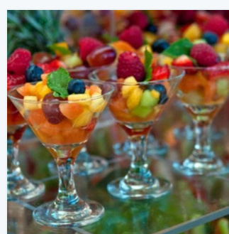
Martini Salad Bowls 1 per person Tier 1