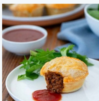
Party Pies and Sausage Rolls 2 per person