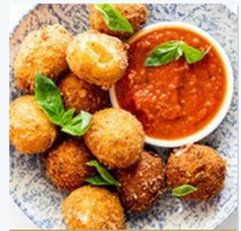
Arancini Balls 2 per person