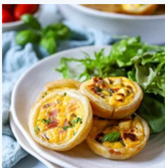
Mini Quiches 2 per person