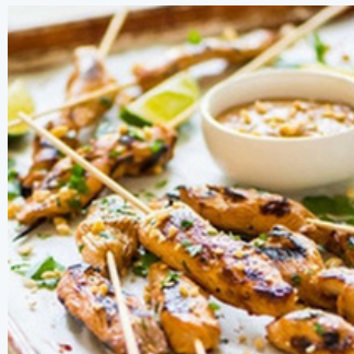
Chicken Skewers 2 per person