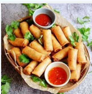
Spring Rolls 2 per person