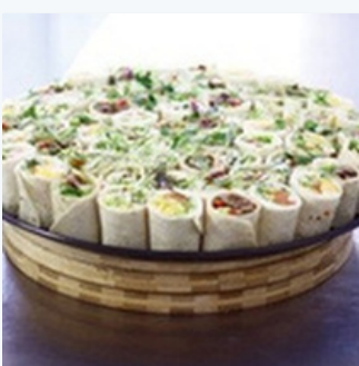
Mini Wraps 2 per person Tier 1