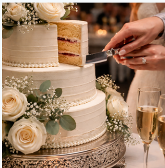
Your cake cut by our staff $5 per person