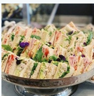
Sandwiches 2 per person Tier 1