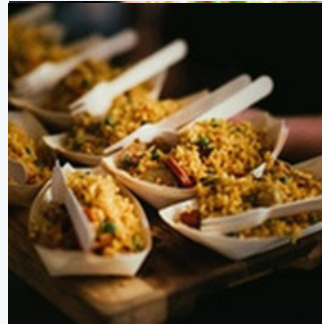
Food Truck Style Mini Mains Custom Pricing depending on choice